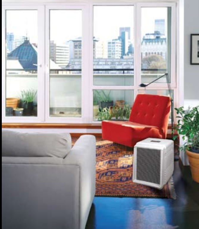
C-90B ELECTRONIC AIR CLEANER